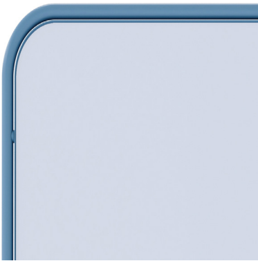
Enamel - Blue Board frame: RAL 5024