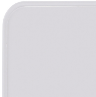
Enamel - White Board frame: RAL 9016