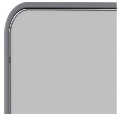
Enamel - Grey Board frame: RAL 7037